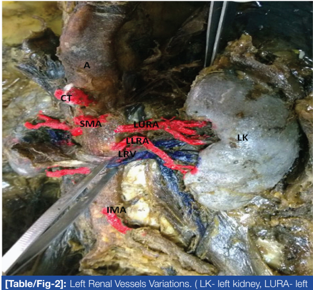
upper renal artery, LLRA- left lower renal artery, LRV- left kloney, LORA- left or celiac trunk, SMA- superior mesenteric artery, IMA- inferior mesenteric artery, A- aorta)

renal veins coming out from the hilum of left kidney and they joined to form the main left renal vein, which passed in front of the aorta. The lower vein rather than the main left renal vein received the ovarian vein of the left side [Table/Fig-2].